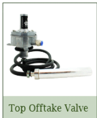
Top Offtake Valve