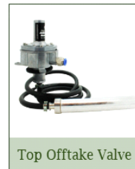
Top Offtake Valve